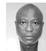
Hon. Foday Rado Yokie Minister of Mineral Resources Sierra Leone