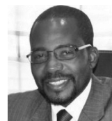
Hon. Gabriel Mbaga Obiang Lima Minister of Mines, Industry & Energy Equatorial Guinea