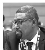
Hon. Abdirashid Mohamed Ahmed Minister of Petroleum Republic of Somalia