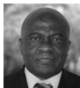
Hon. Rubens Mikindo Muhima Minister of Hydrocarbons DRC