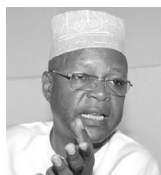
Hon. Houmed M'Sadié Minister of the Economy, Investments & Energy Comoros