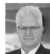
Hon. Alan Winde Premier Western Cape, South Africa