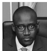
Hon. Abdourahmane Cissé Minister of Petroleum, Energy & Renewable Energy Côte d'Ivoire