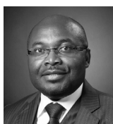
Hon. Noël Mboumba Minister of Energy Republic of Gabon