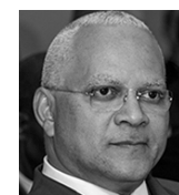
Hon. Jean-Marc Thystère Tchicaya Minister of Hydrocarbons Republic of the Congo