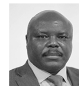
Hon. Joseph Cudjoe Deputy Minister Ghana