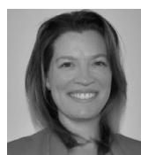
Emma Wade-Smith OBE Her Majesty's Trade Commissioner for Africa United Kingdom