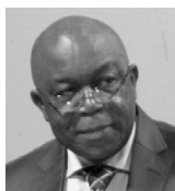
Hon. Mbolli Fatran Minister of Mines & Geology Central African Republic