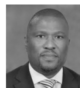
Hon. Lubabalo Oscar Mabuyane Premier Eastern Cape, South Africa