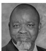
Hon. Gwede Mantashe Minister of Mineral Resources South Africa