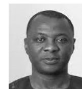
Deputy Minister Adam Amin Ministry of Energy and Petroleum Ghana