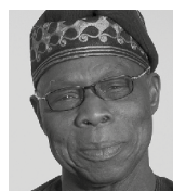
H.E. Olusegun Obasanjo Former President of Nigeria Republic of Nigeria