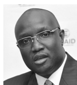
Hon. Mouhamadou Makhtar Cissé Minister of Petroleum Republic of Senegal