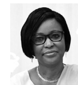
Hon. Lelenta Hawa Baba Bah Minister of Mines & Petroleum Mali