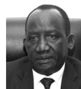
Hon. Koang Tutlam State Minister for Petroleum & Natural Gas Federal Democratic Republic of Ethiopia