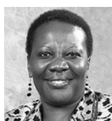
Hon. Irene Muloni Minister of Energy & Mineral Development Uganda